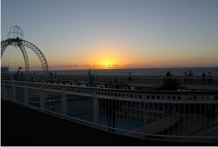
Sunset out on the Pacific Ocean.