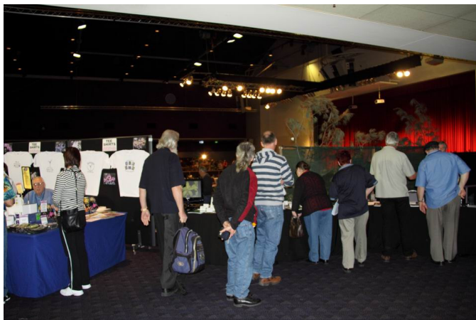
Entering the show area.