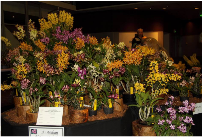
Another colourful display.