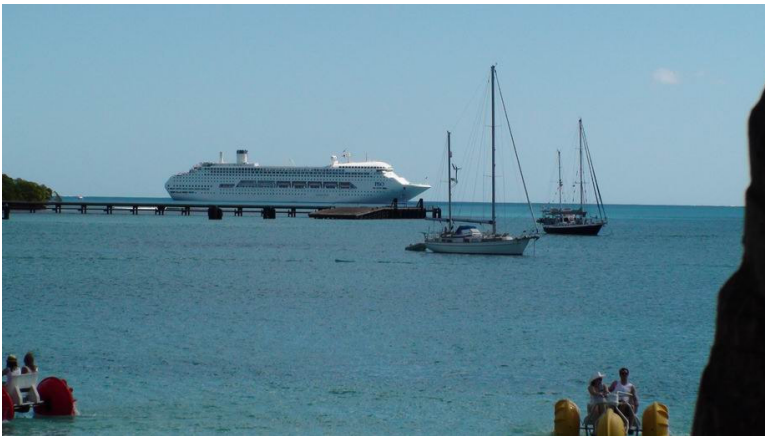
Parallel parking our ship, "Pacific Jewel", at the Isle of Pines.