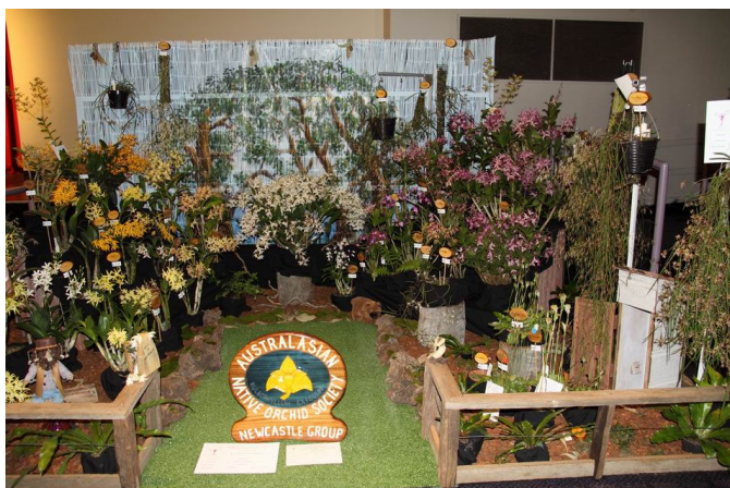
A fine display.