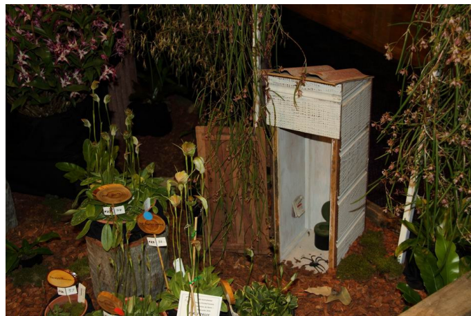
More detail of this fine display.