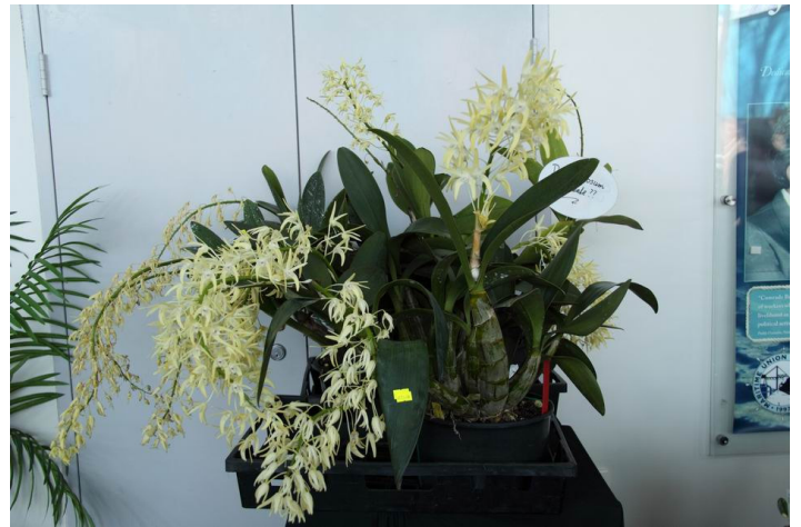
Plant for sale.