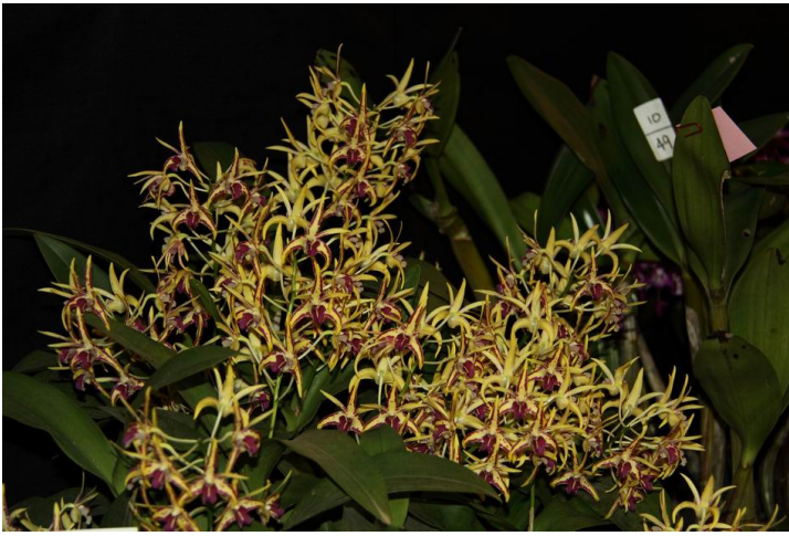
Reserve Champion. Den. Jesmond Treasure x Den. speciosum 'Ashlee'