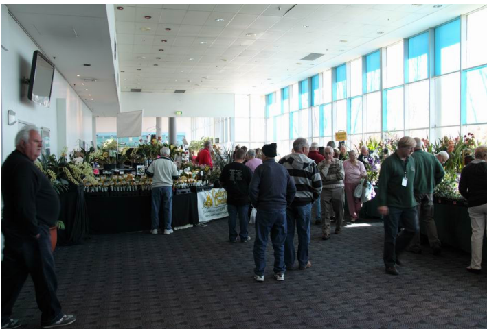
In the sales area.