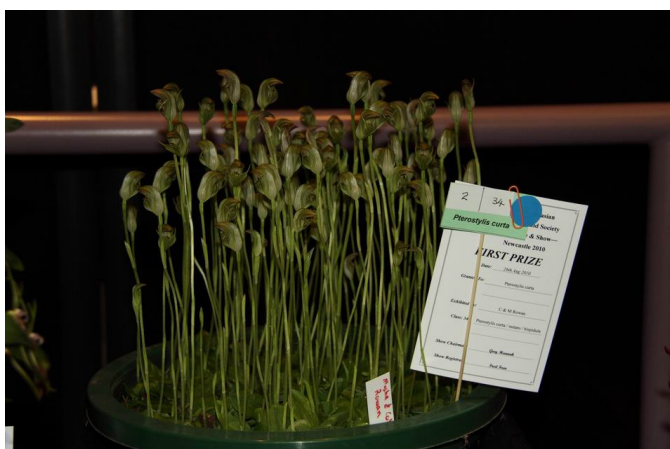
A pot full of Pterostylis curta