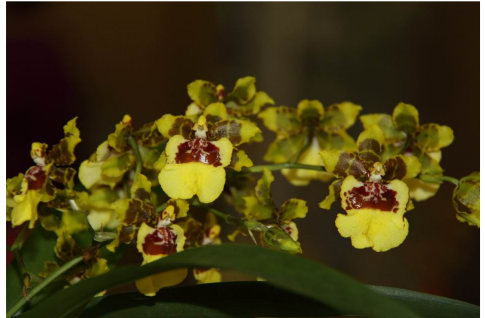
Mtdm. x Onc.