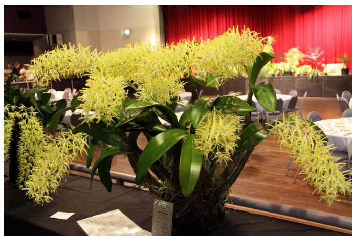
Grand Champion. Dendrobium speciosum (GF x Glen) 'Denbra'