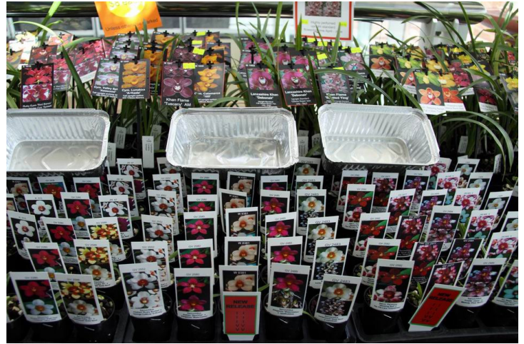
One vendor's sales area.